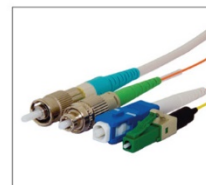
Available for Lynx-Custom Fit™ Splice-On Connector