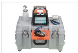
Carrying case with worktable CC-72